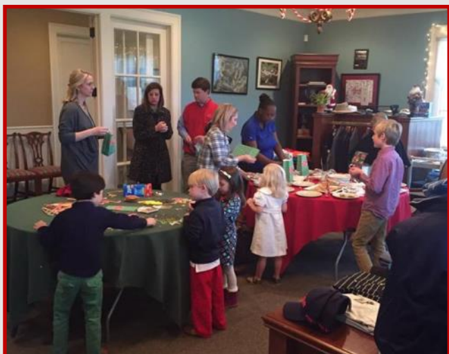
The kids had a blast making ornaments and decorating Gingerbread men.