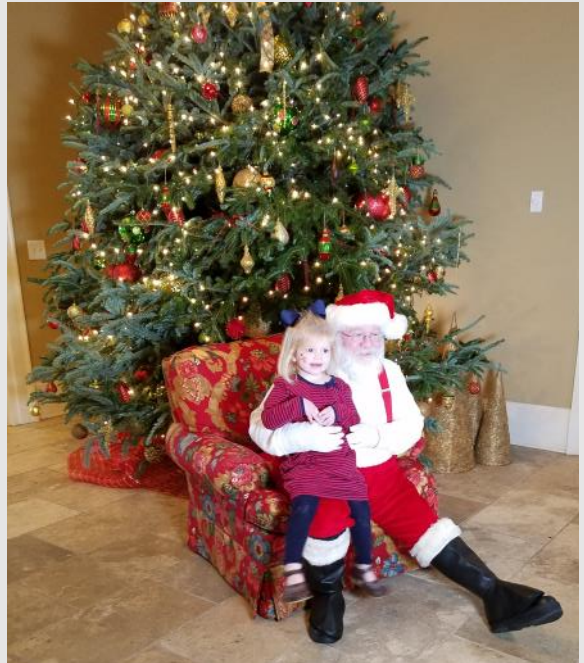
Santa made an appearance to take pictures with the kids during the Sunday Brunch.

Please note our policy regarding play while there is lightning nearby. For the safety of our members and their guests, when lightning is within a 5 mile radius, we will sound the siren letting players know that the course will be closed at that time. All players must leave the course once the siren has been sounded.